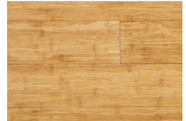
Cornsilk - Natural

*Samples are only a small representation of actual product. It should be recognized that color and grain variability is an inherent characteristic of the different species.