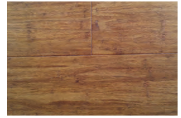
Cinnamon - Carbonized