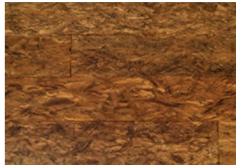
Burlwood - Carbonized & Braided